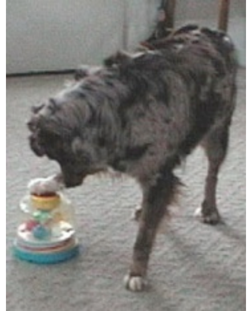
Ruby, my first service dog trainee, who I raised and trained for nearly 2 years, is shown here working on paw touches and increasing strength in pushing buttons.

It's interesting how many people think that they want a Service Dog, but have not considered the very specific details of how the dog will assist them on a daily basis. A Service Dog does not change the physical disabilities that you have. The media often portrays only the very best, most rewarding side of owning a Service Dog, so it is easy to believe that it will change your life completely. A Service Dog can help you adapt to situations in a way that you were once unable to do. But, in order to do that, specific tasks must be identified and then reinforced. You may find that it is far easier to use a walking cane for mobility issues than to have a dog with you at all times. You may find that you are rarely away from someone (even a helpful stranger) who can pick up a fallen object from the floor, on the rare occasion that might happen to you, making a Service Dog truly unnecessary or cumbersome, if that is one of the jobs your hope your dog will provide. Specifically identifying trainable tasks is critical in making the final assessment as to whether a Service Dog is the right option for you.