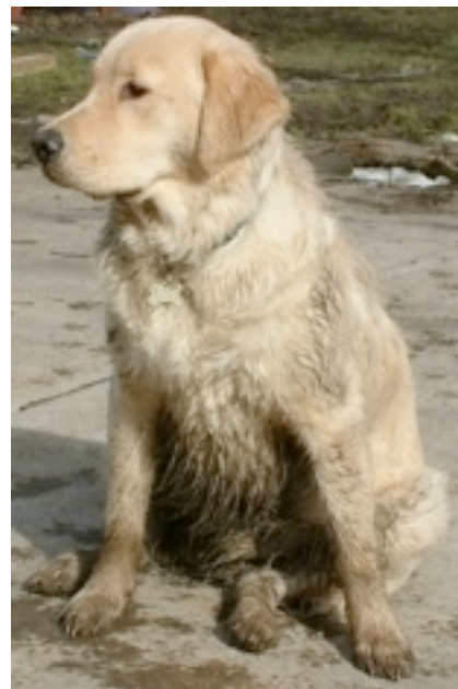
This Golden Retriever could find mud in a desert, but a calmer, sweeter, gentler disposition would be hard to find!

No matter how highly trained you might become as a team with a Service Dog, he or she nevertheless is a dog and will need dog fun time as well. A Service Dog is an educated animal that has been conditioned to live in a human society. If you cannot tolerate the transition to and upkeep of your pet as a public-access Service Dog, we strongly suggest something other than a Service Dog as an intervention for your disability.